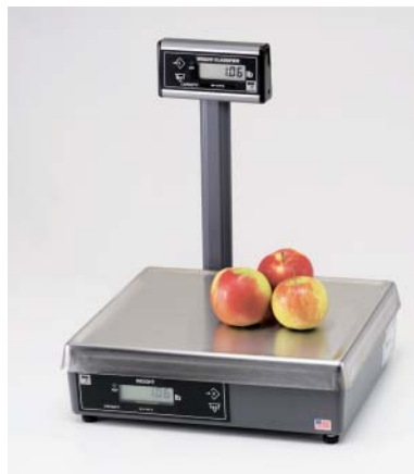
shown with internal display and optional remote post display

Point-of-sale interface scale for linking to electronic cash registers or POS terminals.