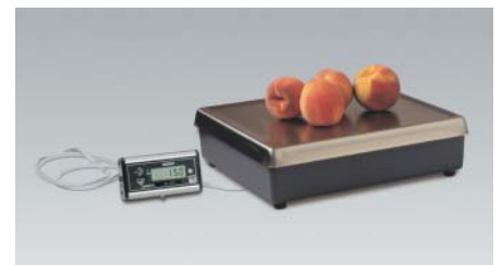
shown with remote display